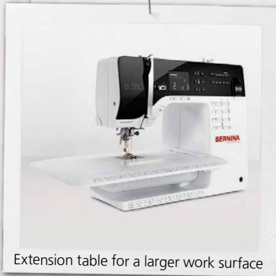
Extension table for a larger work surface